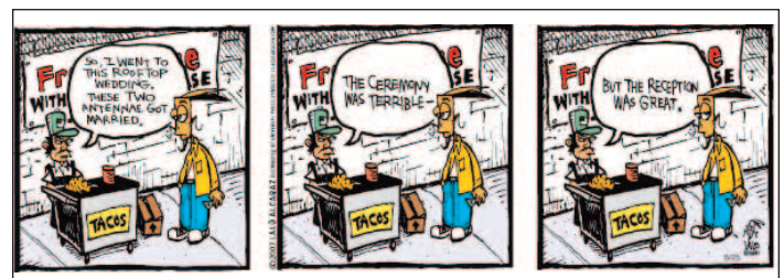
LA CUCARACHA by Lalo Alcaraz