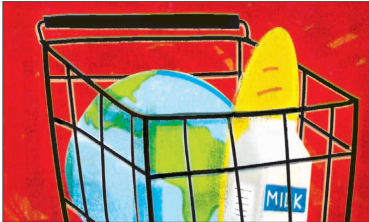
ILLUSTRATION BY ANDREW MAHNS